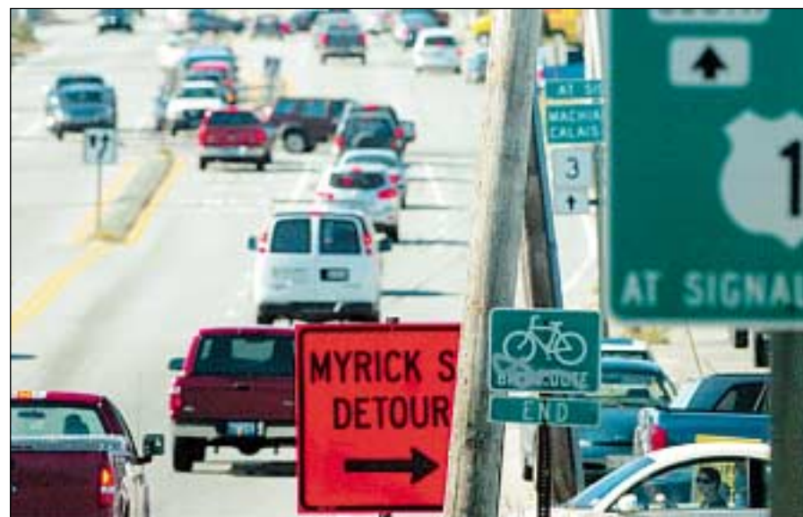
Traffic from Myrick Street in Ellsworth is directed to the intersection of Route 3 and Route 1.